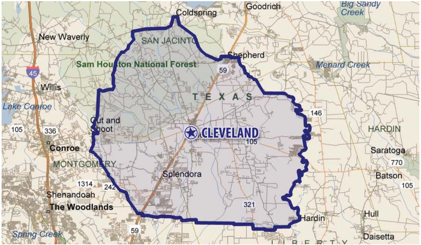
:: Retail Trade Area Map | Cleveland